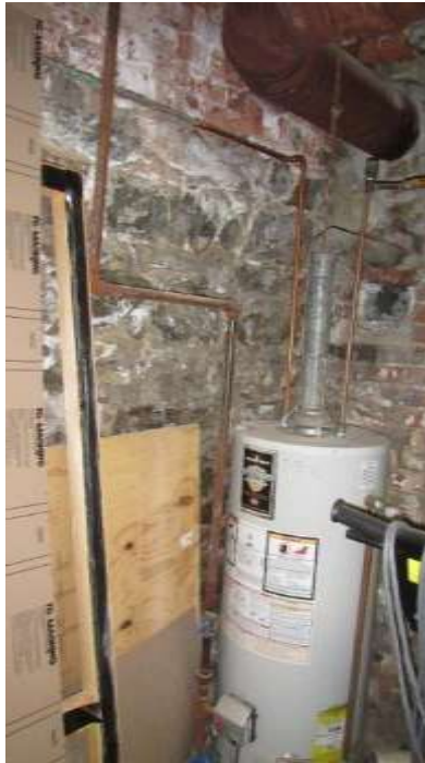
Furnace room with brick-and-mortar interior wall shared by DPD office with damaged wainscoting