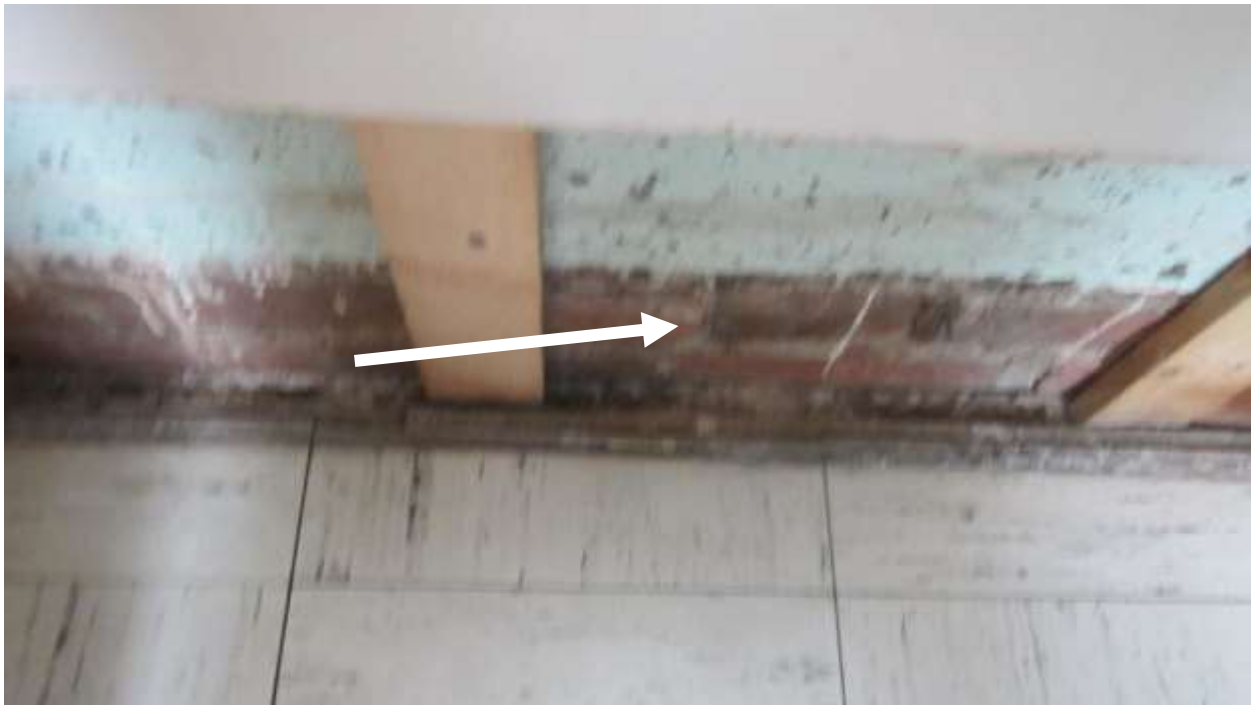
Base of foundation wall in flooded restroom consists of brick and mortar to the floor