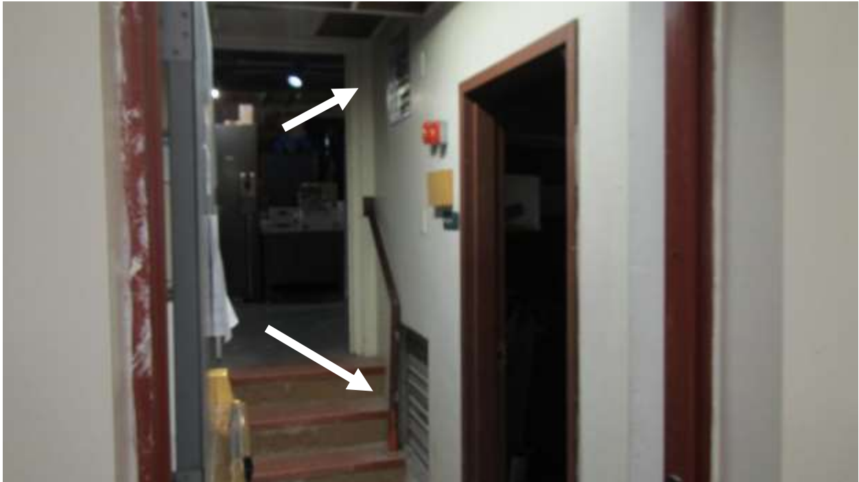
Louvers in furnace room hallways