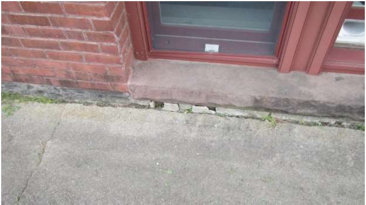
Gap between cement apron and basement windowsill