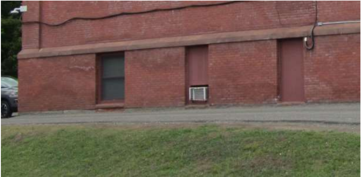
Permanently installed window air conditioner