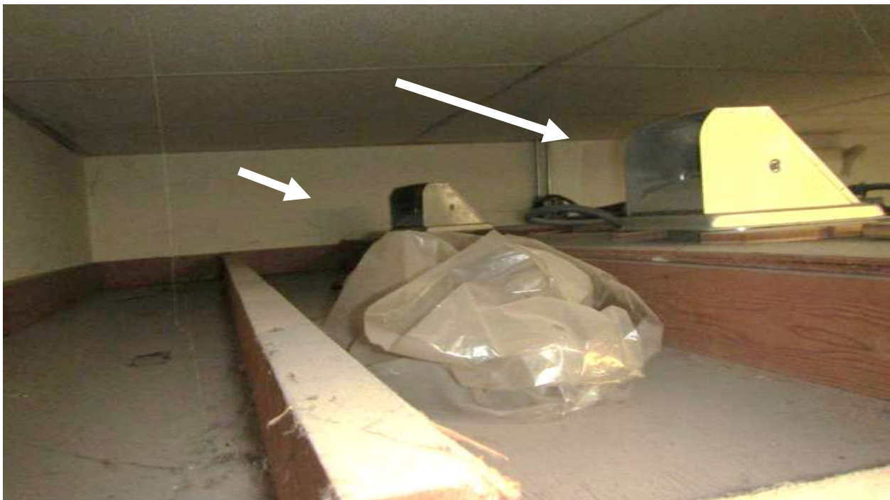
Exhaust vent for cells, note no ductwork connected to outdoor vent