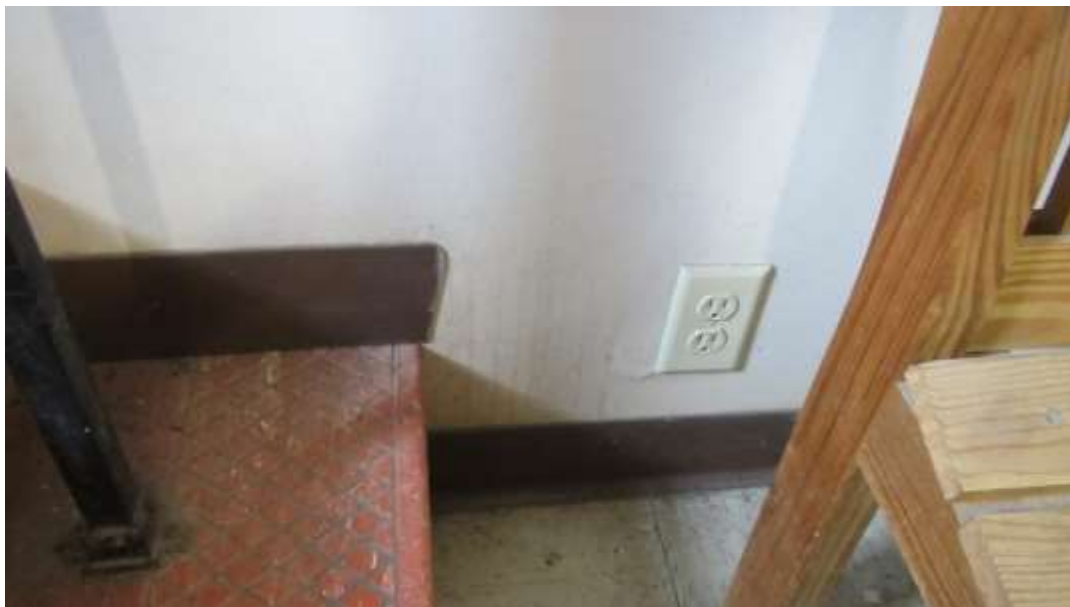
Wall outside restroom made of GW with plastic coving