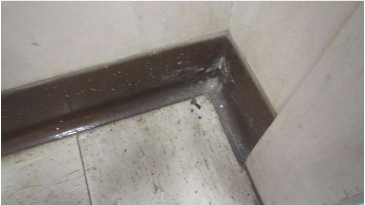
Rodent droppings in main hallway