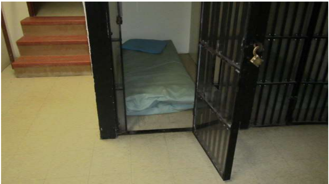
Holding cells with gypsum wallboard walls