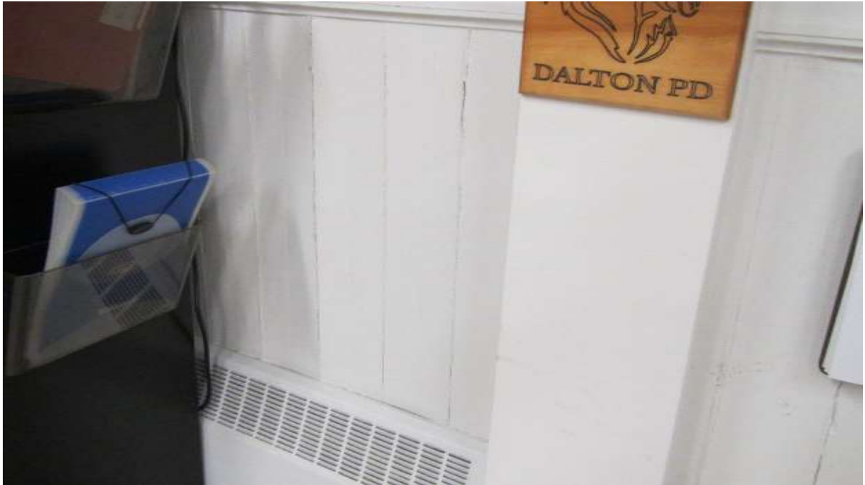
Warped wainscoting, indicating possible water penetration through foundation wall