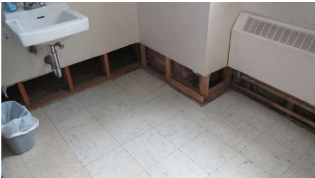
Removed GW wetted by flooding