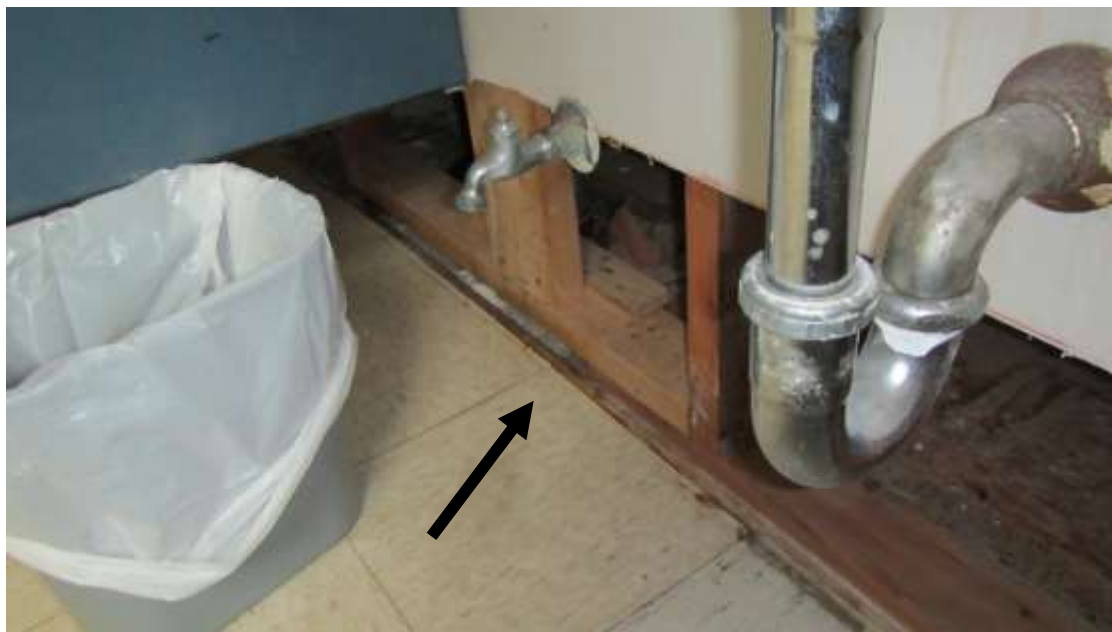
Open seam on floor edge, note lifting tile likely from water exposure