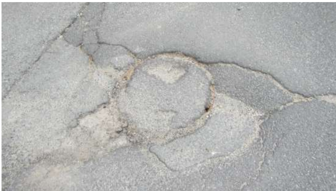
Possible sewer manhole cover, likely not accessed since covered with tarmac