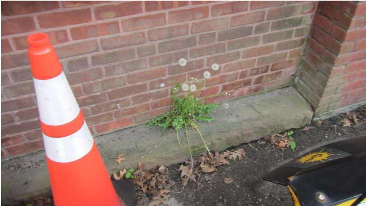
Gap between the foundation and tarmac, also space in sill and brick joint