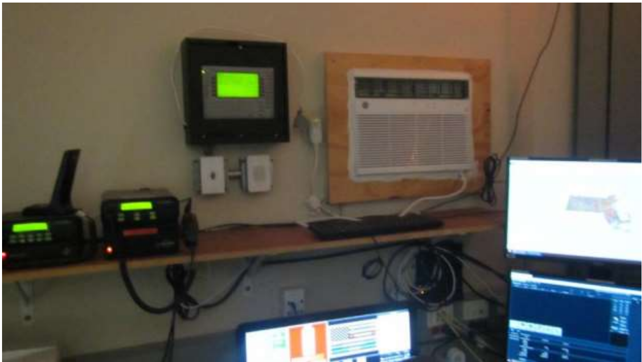
Window air conditioner - interior side of Picture 1