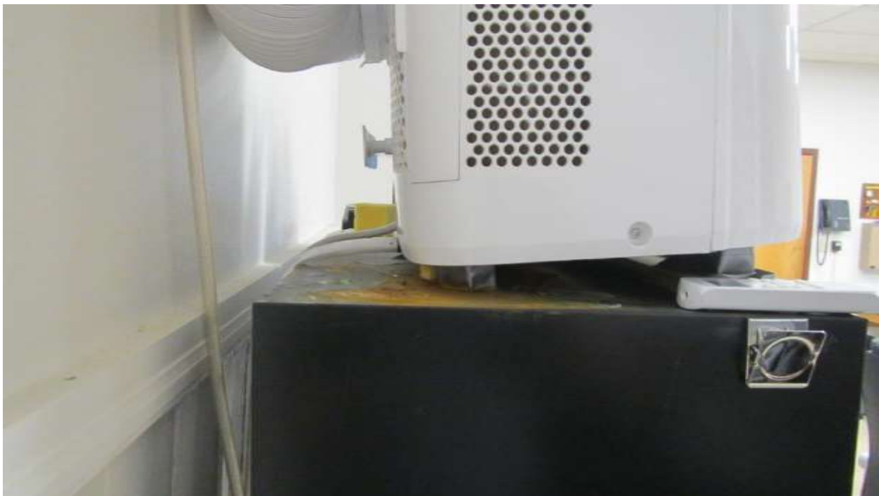
Cabinet corrosion from condensation overflow of portable air-conditioner in Picture 3