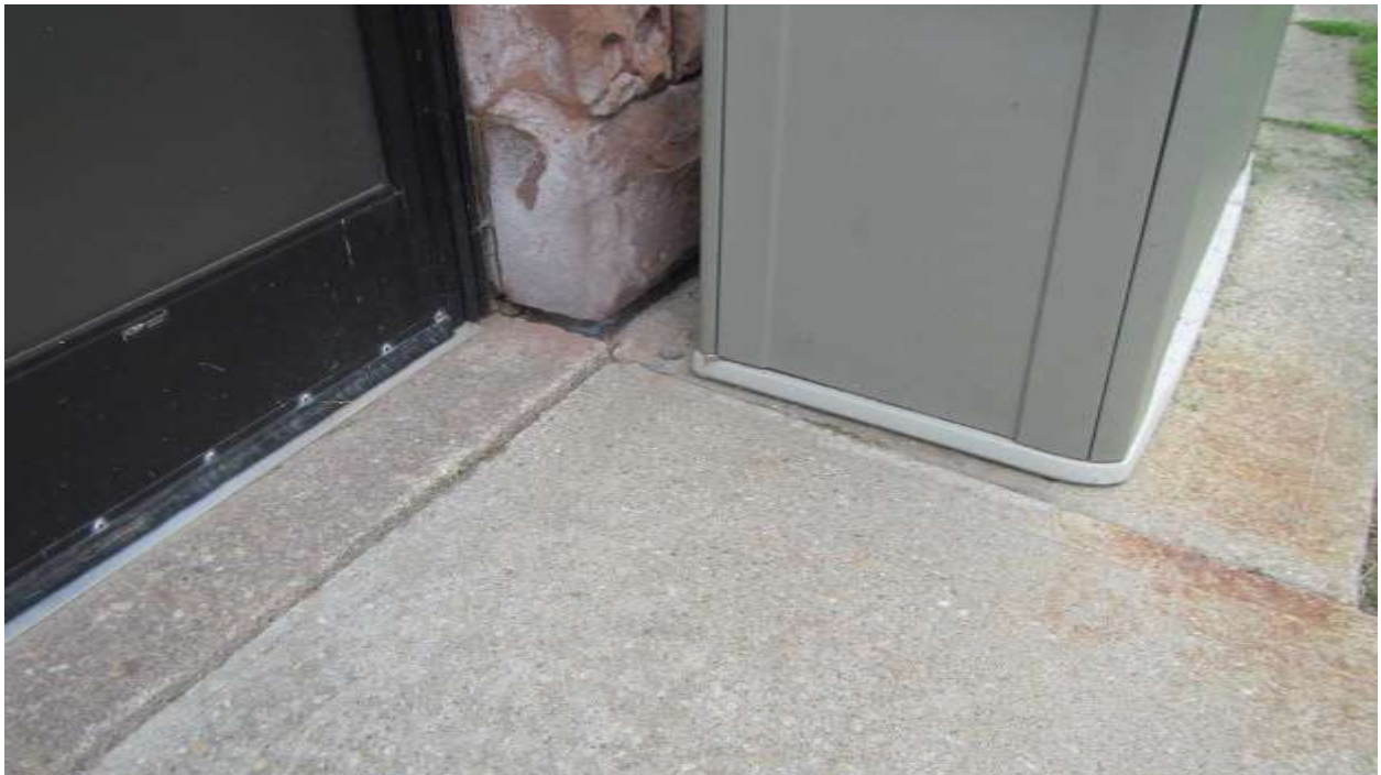
Gap between sidewalk and foundation wall where water can accumulate