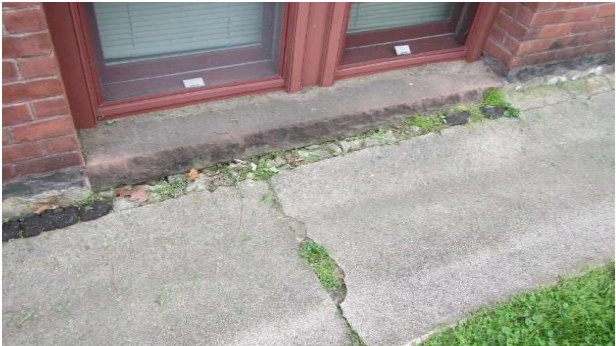
Seams in cement apron exposing soil to become moist from rain Note plant growth between cement slabs of apron as well as the windowsill and apron