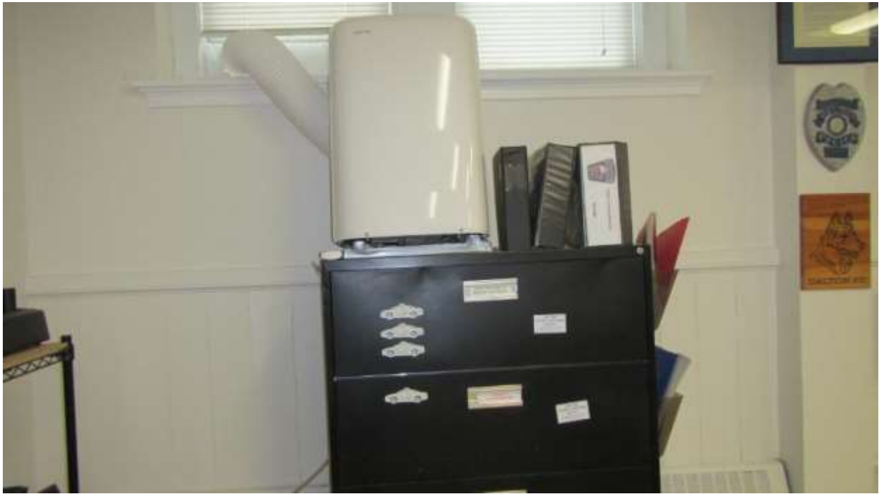
Portable air-conditioner balanced on top of file cabinet